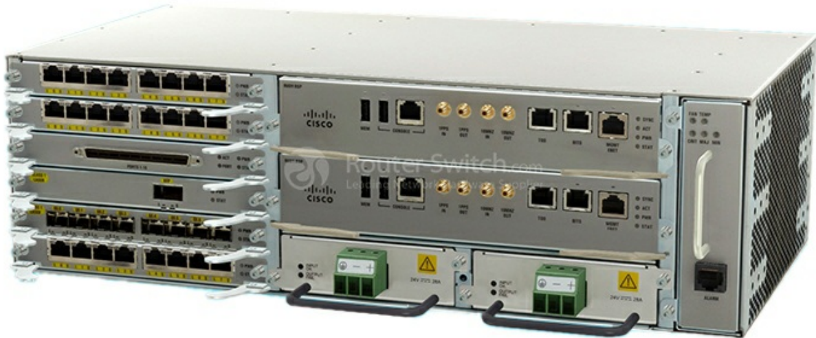
Table 1 shows the quick specs.

Figure 1 shows the appearance of ASR-903. Those modules in the chassis must be purchased separately.