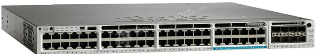
Figure 2 shows the back panel of the WS-C3850-12X48U-L switch.

Figure 1 shows the appearance of the Cisco Catalyst WS-C3850-12X48U-L.